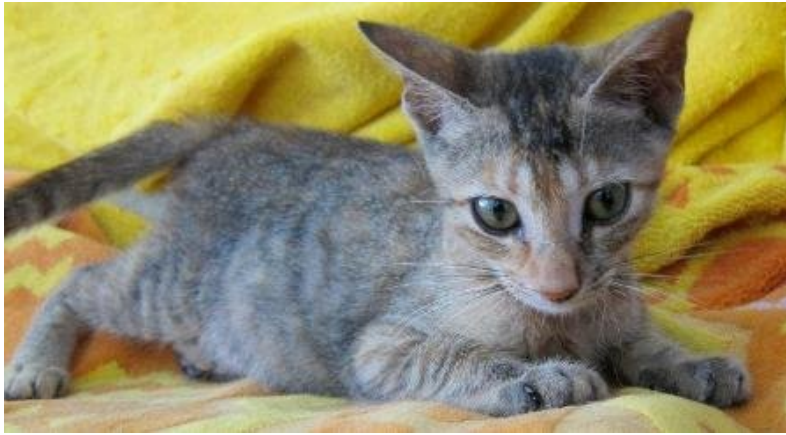
Miel, female six months