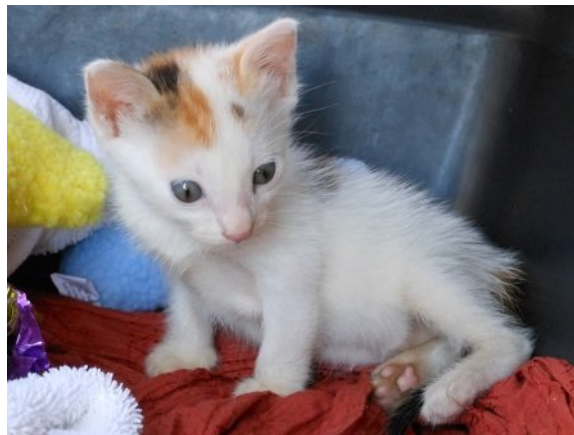
Pinot Grigio, female four weeks