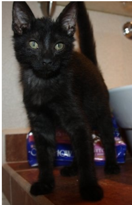
Magic, male two months