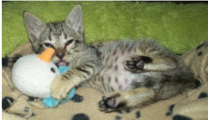
Spike, male two months