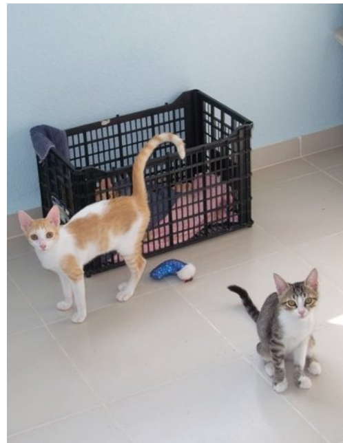
Meet Truffle and Flora in the hospital room.