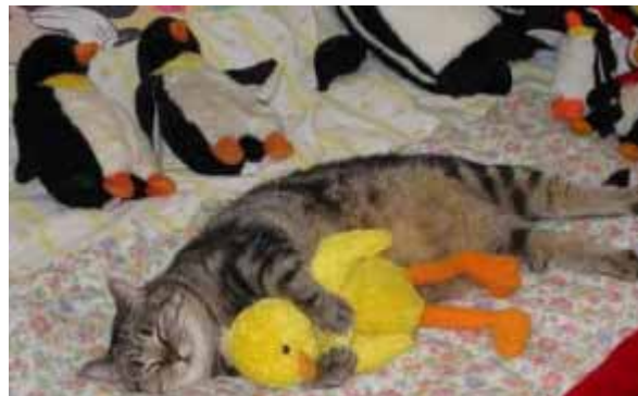
cat adopts bird