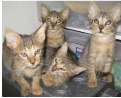
Unnamed family – three girls and a boy