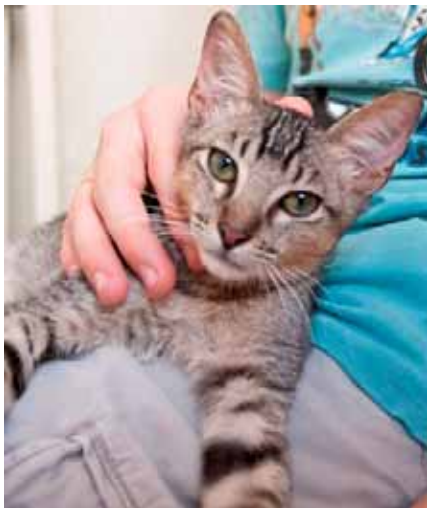
Juan, male, 4 mos (he looks like a lover to me!)