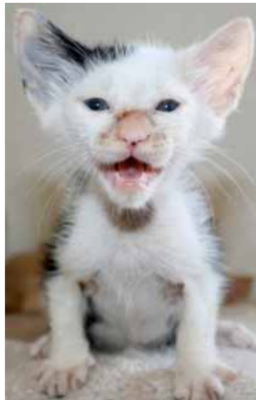
Mayana, female, 4 wks