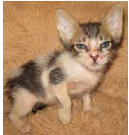
Grampy, male, 4 wks