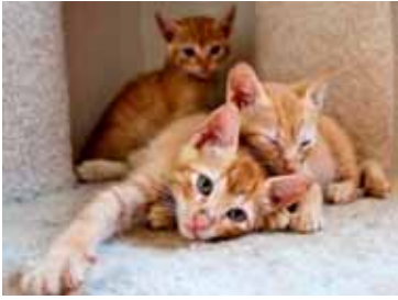
Mario, Maribella and Opal 1 male, 2 female, 6 wks