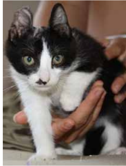
Pacino, male, 4 mos