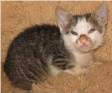
Dolce, male, 4 wks