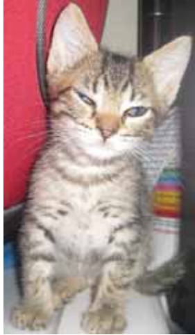
Milo, male, 6 wks