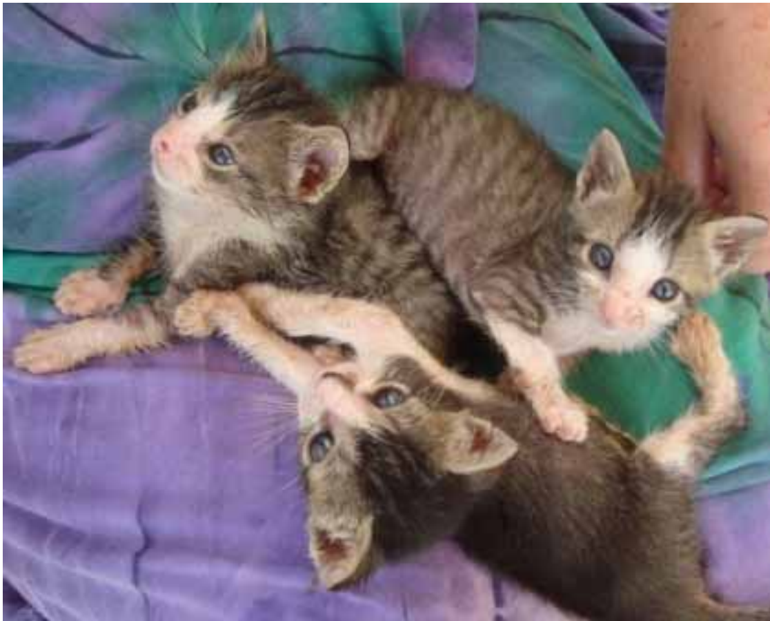
Larry, Curly and Meow, 2 males, 1 female, 4 wks