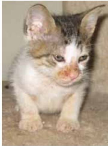
Gabana, male, 4 wks