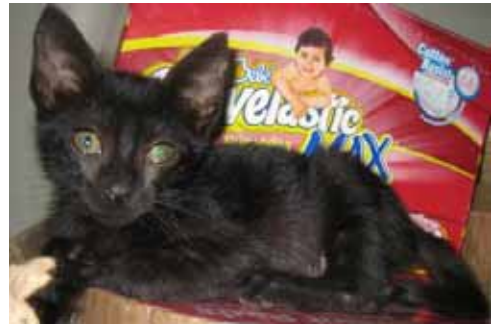
Tabata, female, 6 wks