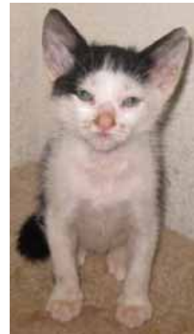
Chanel, female, 4 wks