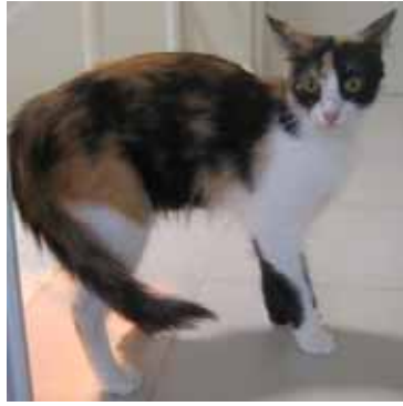
Elizabeth, female, adult