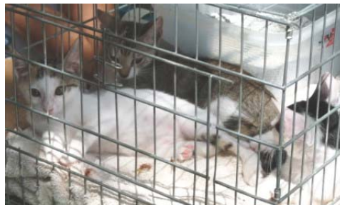
Kittens posing daintily on display

What a fantastic day, people!! We received donations, we sold CCR t-shirts, we re-homed some kittens and we sold a ton of our friends' donated items: Coco's Cat Rescue made over $4,677 pesos!!