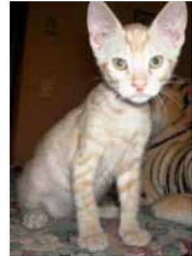
Caspar male, 3 months