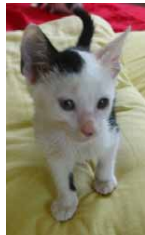
Kaluha, female, 3 months