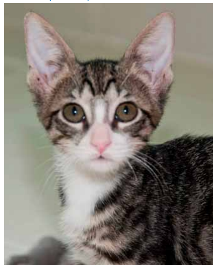
Precious, female, 2 months