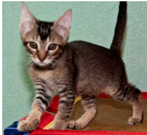
Peter, male, 2 months