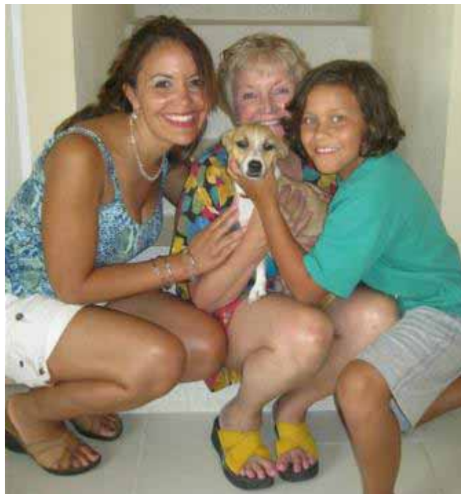
Esperanza's forever family!

And Esperanza has already found her forever home! A wonderful family met her at kitten cuddling and could not resist those big brown eyes and the inter-species generosity of this lovely dog. As soon as the kittens are weaned at the end of August, Esperanza will be adopted.