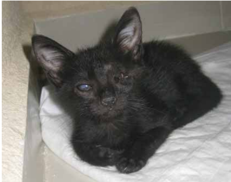
Karma, female, 2 months