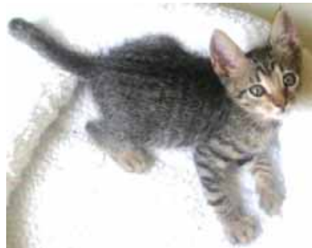
Flip and Flop, both male, both 3 months old!