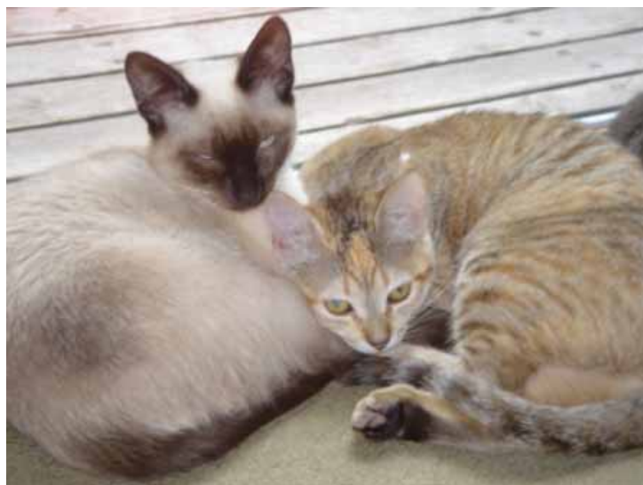
Two very happy cats!

Do you remember Roxie? She was a very sick kitten with plastic perforating her bowel and we thought she wouldn't make it. But she survived and was adopted by a Minnesota family, along with Carmen, also from Coco's. Here they are in a recent photo: