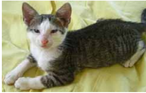
Dolce male, 3 months