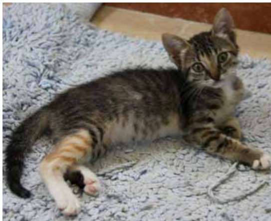
Jade, female, 4 months