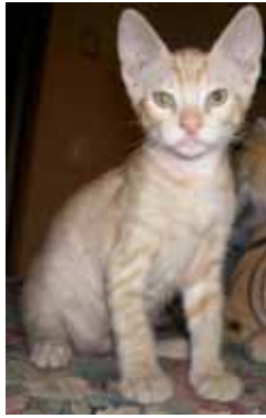
Dante male, 3 months