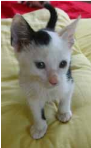
Mayana, female, 3 months