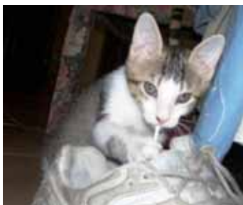
Mona, female, 3 months