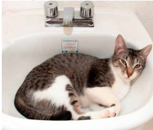
Picola, female 7 months