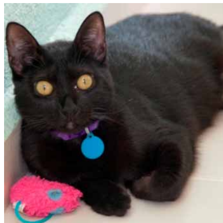
Dusty, female 6 months