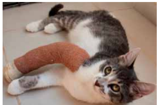
Cucho, male 4 months