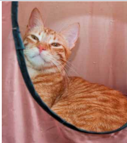
Biscuit, female 8 months