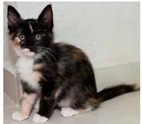
Zippy, female 3 months