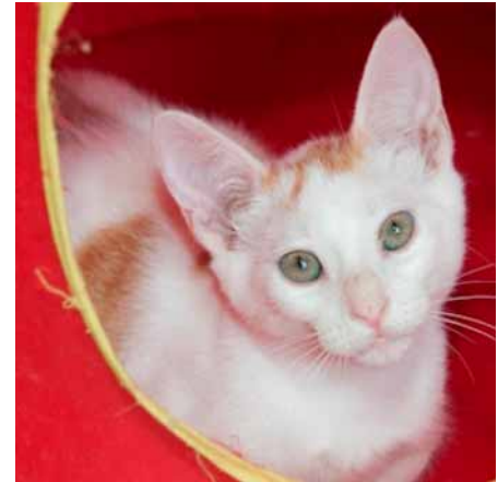
Niko, male 2 months