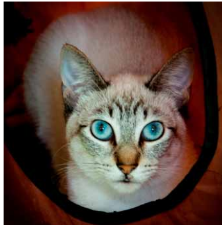
Libby, female 5 months

Is your new pet in this group? Have a good look and when you can see a kitten or two in your home, just get in touch with CCR at info@cocoscatrescue.org and we'll bring you and your new pet(s) together.