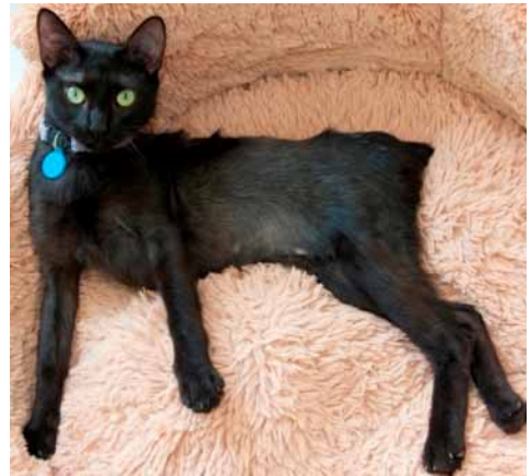
Tara, female 6 months