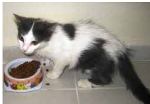
No name cutie – male, 10 weeks

Crunchie is the only one not quite ready for adoption but the rest are good to go!