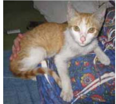
Solavina – female, 3 months