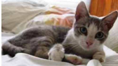
Tom – male, 5 months (adopted on first Kitten Cuddle Day!)