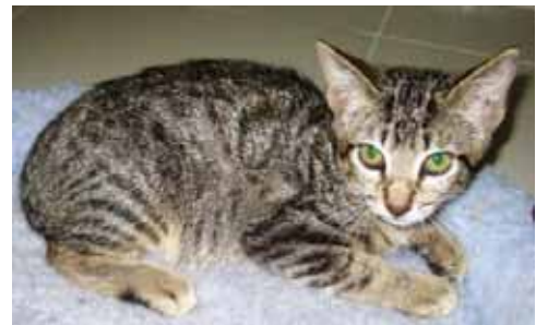
Raylee – male, 7 weeks