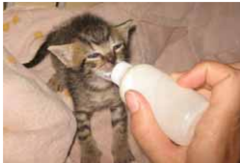
Crunchie – male, 4 weeks